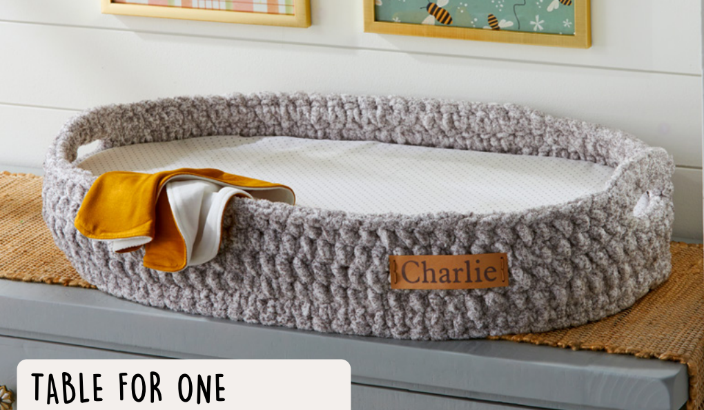
TABLE FOR ONE

Use jumbo weight yarn, like Baby Bee® Cuddly One, to give this soft, lightweight changing pad structure.